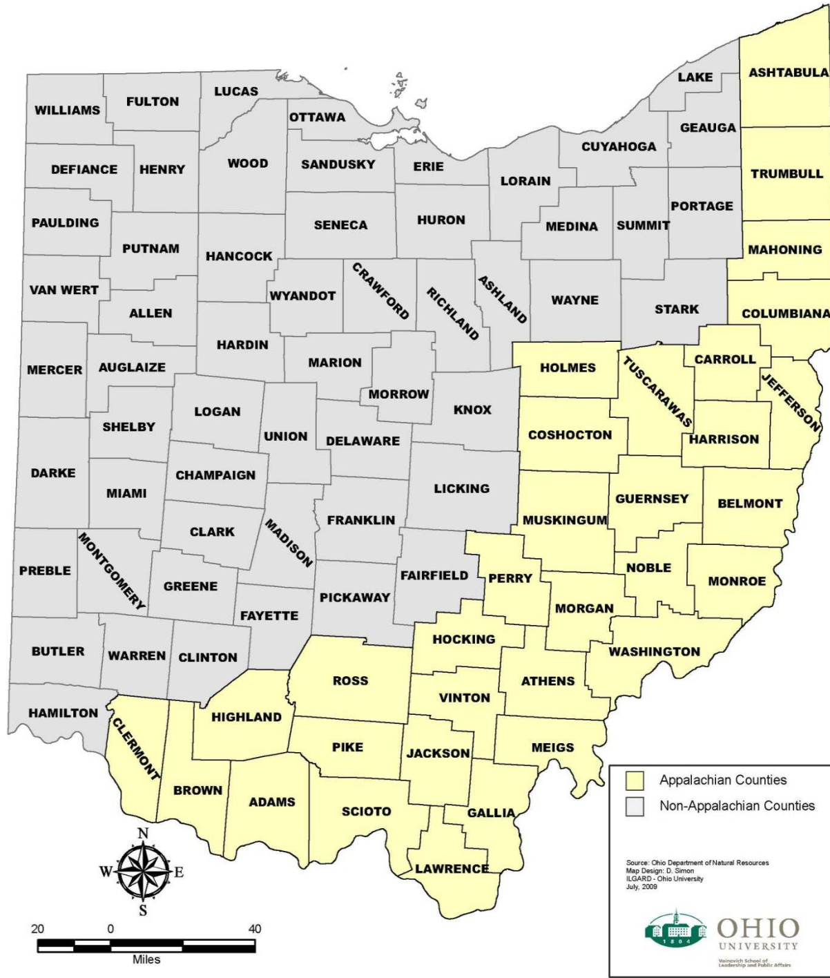
Map 1. Appalachian Ohio Counties